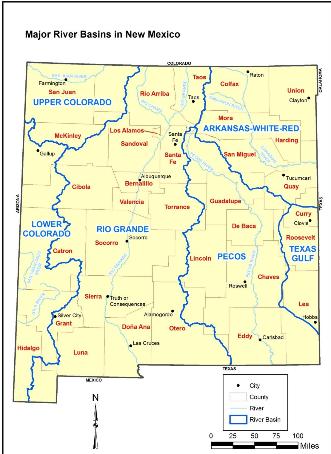
Figure 1. Major river basins in New Mexico