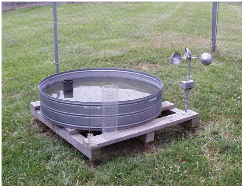
Figure 6.1. Class A Pan

The National Weather Service Class A Pan is 4 feet in diameter and 10 inches deep ( Figure 6.1). It is made of unpainted, 22-gage galvanized iron and sits on a wooden pallet so that the bottom of the pan is raised 6 inches above the ground, allowing air to circulate. Site requirements specify that the pan be located on level ground, unobstructed by trees or buildings, so maximum exposure to sunlight is possible. The pan is filled with water to within 2 inches of the top and is refilled as soon as the water level drops 1 inch. The depth of water is measured with a micrometer hook gage located in a stilling well that supports the gage. An anemometer, which is used to measure wind movement, is mounted on the pallet, with the cups positioned 24 inches above the base of the pan. Maximum/minimum thermometers (which are stored in an instrument shelter) and a rain gage are also installed at the site. A 5-foot-high wire-mesh fence encloses the entire installation. A pan reading is taken every morning.